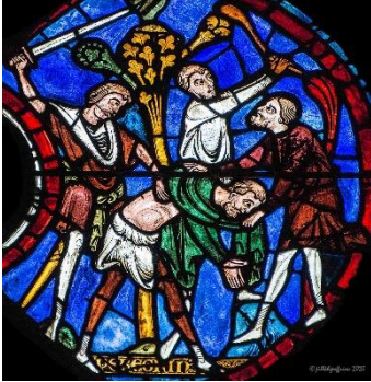
Robbers beating the pilgrim (Good Samaritan window, Chartres Cathedral, France)

COUNTERS NEEDED: We are looking for volunteers to assist with offertory counting on Tuesday mornings for about an hour. Please contact the office if you are interested.